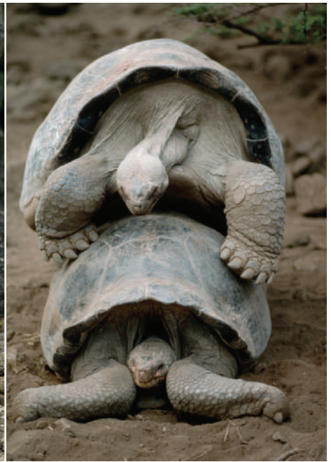
Take your partner: most male tortoises are keen to acquaint themselves with the opposite sex (right), but Lonesome George (top left) is less accommodating.